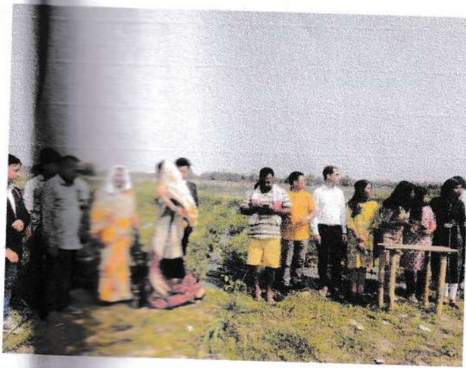
A photo of Field Visit at Bhootjalakia production place Bank of Chai Nadi, Nilok GP, Dhemaji along with Students and teachers of Silapathar Town College and Agriculture University Jorhat.