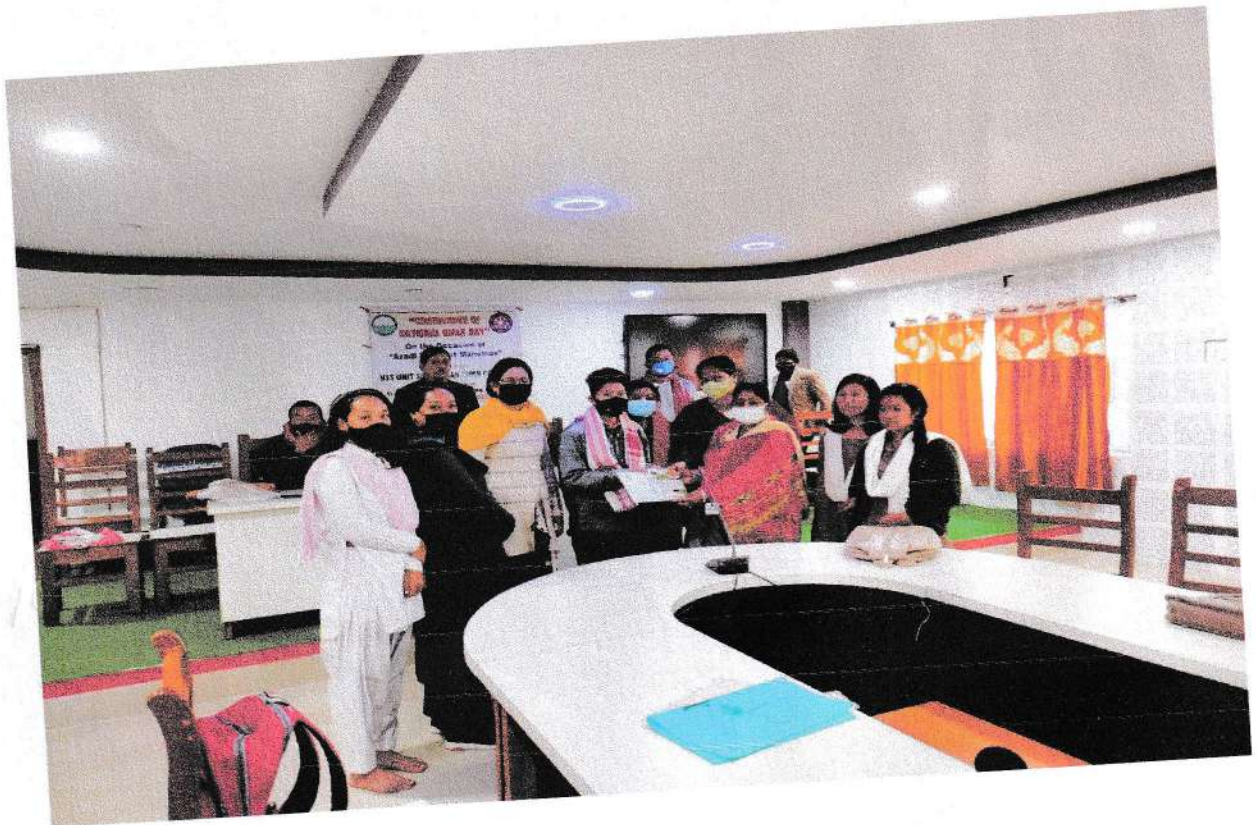
Photo of National Girl's Day Organized by Women Cell Silapathar Town College