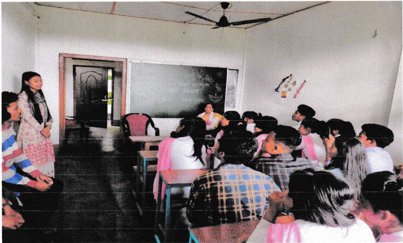
Farewell of 6 th semester students held in the department every year.