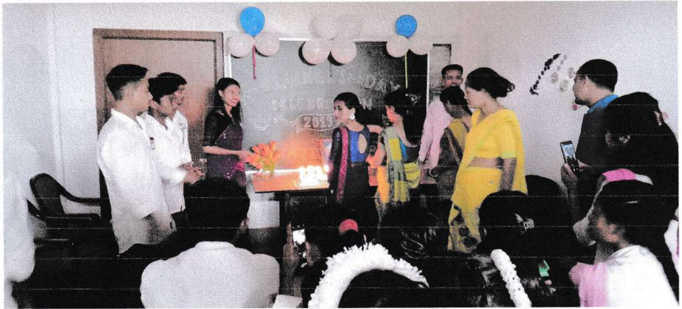
Teacher's day celebration at the department of Education on 5 th September in Every year.