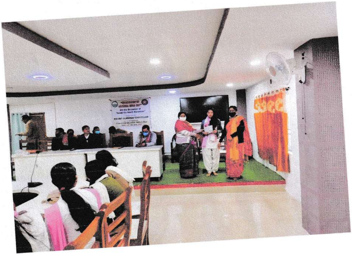
Photo of National Girl's Day Organized by Women Cell Silapathar Town College