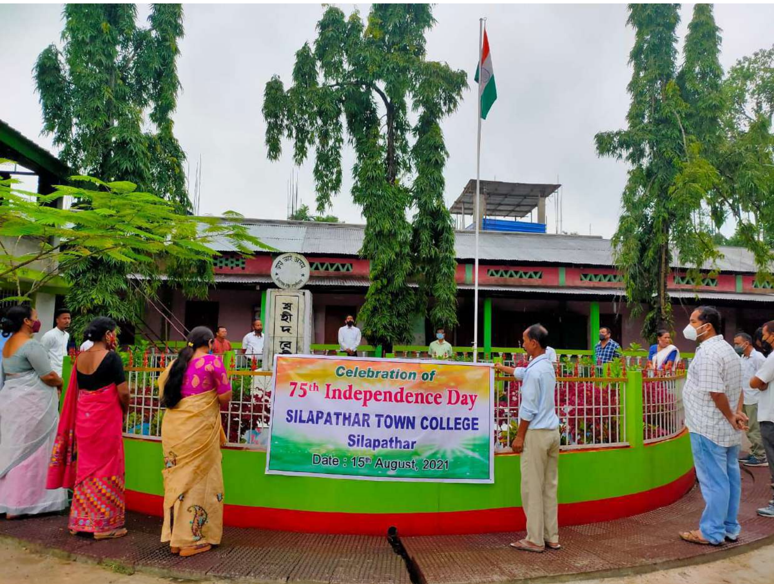
Independence Day Celebration,2021 Teaching and Non-Teaching Staff Silapathar Town College, Silapathar