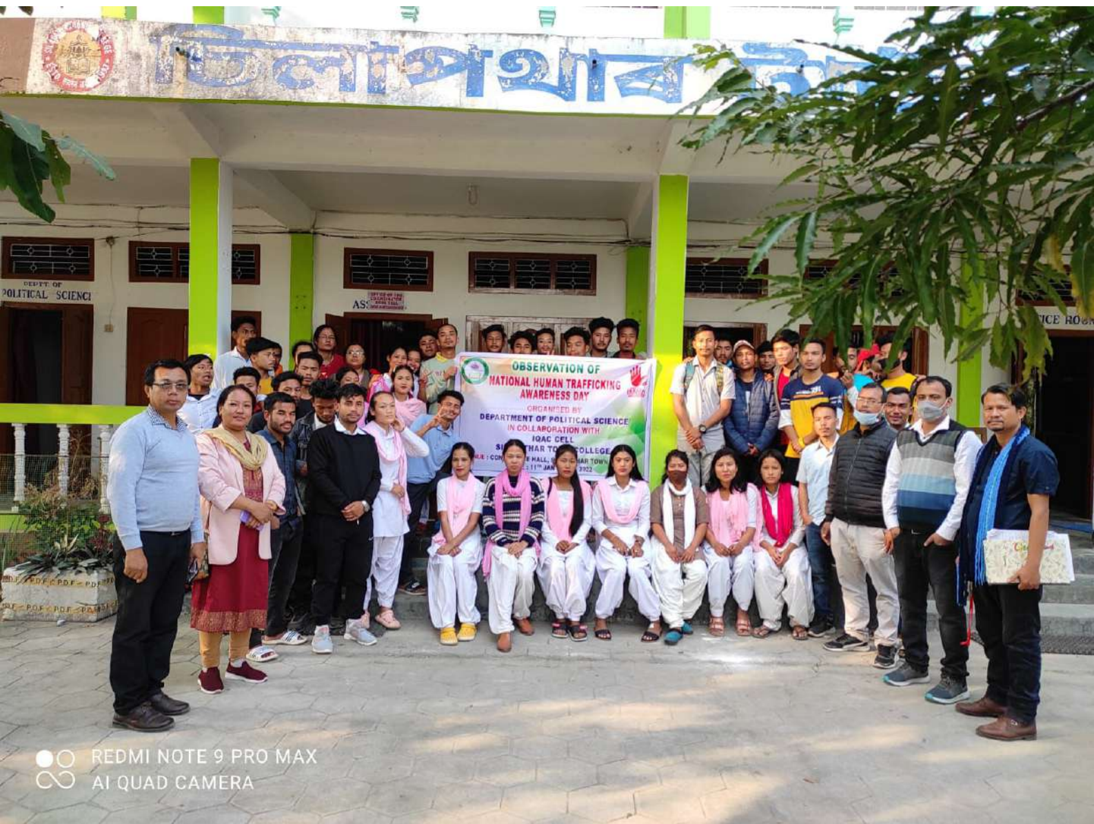
Photo of National Human Trafficking Day, organized by Deptt. of Political Science, in collaboration with IQAC Cell