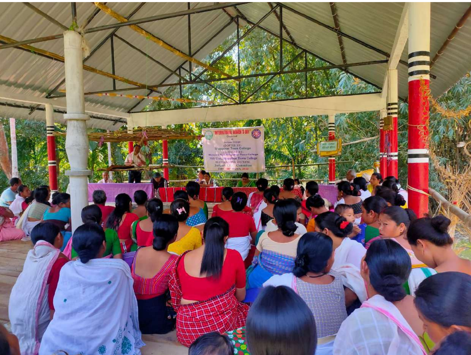
International Women Day Celebration at adopted village Joriguri by NSS Unit and Women Cell, Silapathar Town College